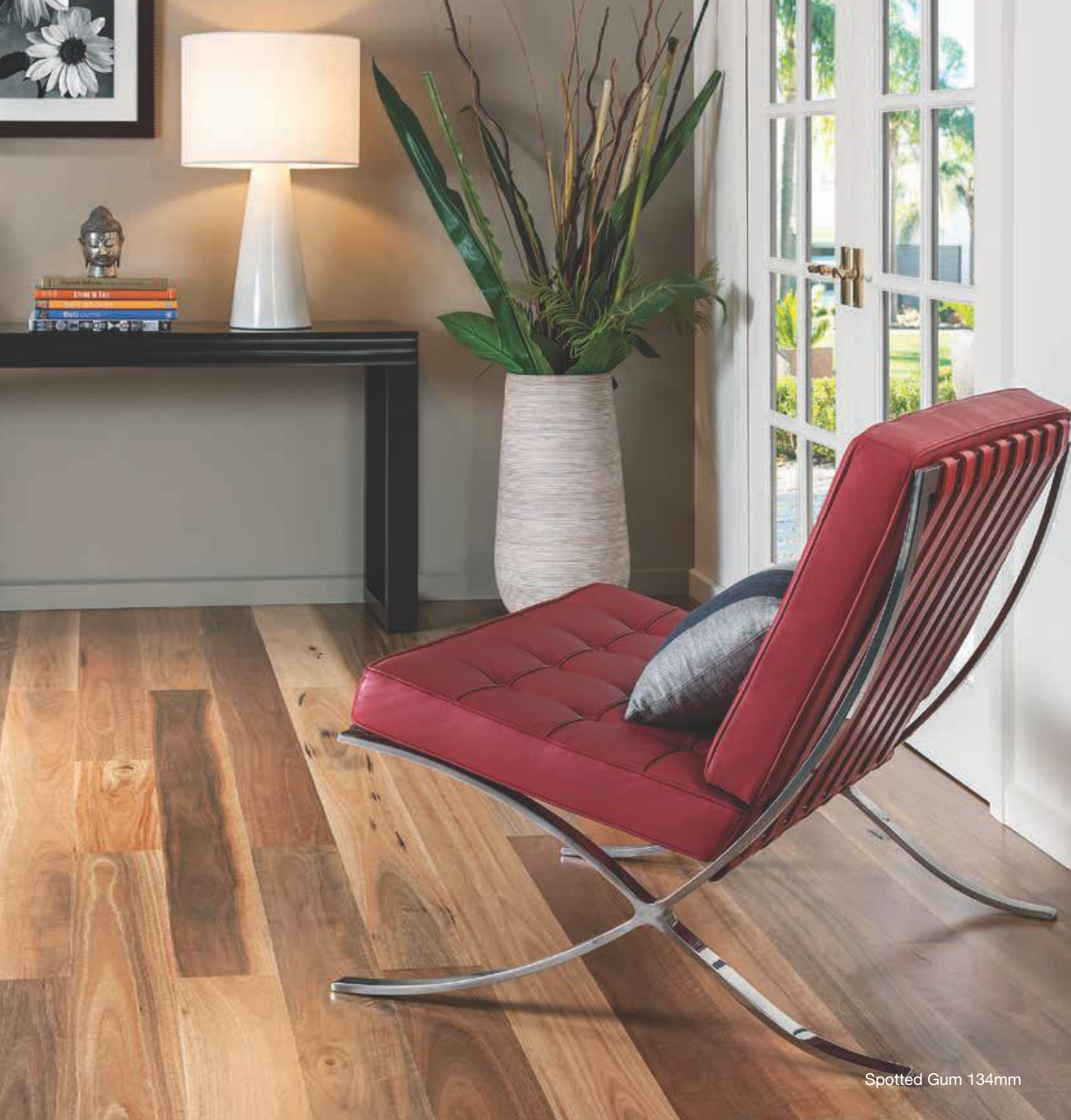
Spotted Gum 134mm

Note: Variations of colour within a timber species are normal, therefore photographs, samples and displays can only be indicative of the colour range of the timber species nominated. Timber is a natural product and commonly reacts to changes in atmospheric and environmental conditions such as humidity and temperature. This is considered normal.